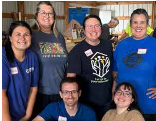
Volunteered at the Sleep in Heavenly Peace shop in Ames to build beds for children in need