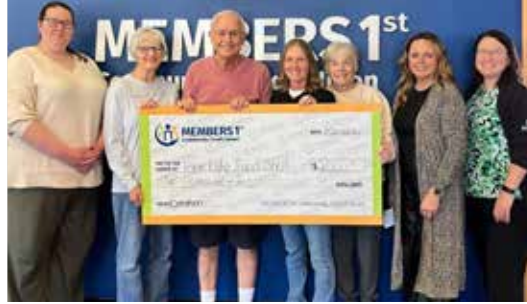
Donation to the Pine Lake Food Shelf in Eldora