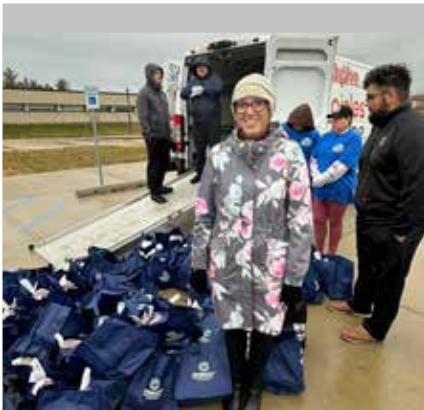
Sponsored Turkeython in Marshalltown to provide holiday meals to the community