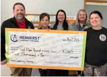
Donation to Pied Piper preschool in Traer to purchase items for small motor skills, room dividers & replacement chairs

As a proud part of Iowa communities, MEMBERS1st supports local nonprofit organizations through financial contributions, in-kind services, and volunteer efforts. Below are just a few of the organizations we've partnered with over the past 12 months.