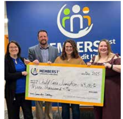
Supported Child Care Junction in Boone to raise funds for new infant cribs