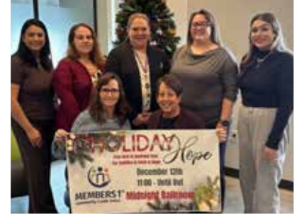
Sponsored Holiday Hope in Marshalltown to provide holiday gifts for families in need